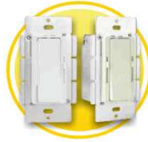
Driver + Dimmer 2 in 1 & CCT