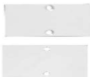
End Cap (Pair) #EC